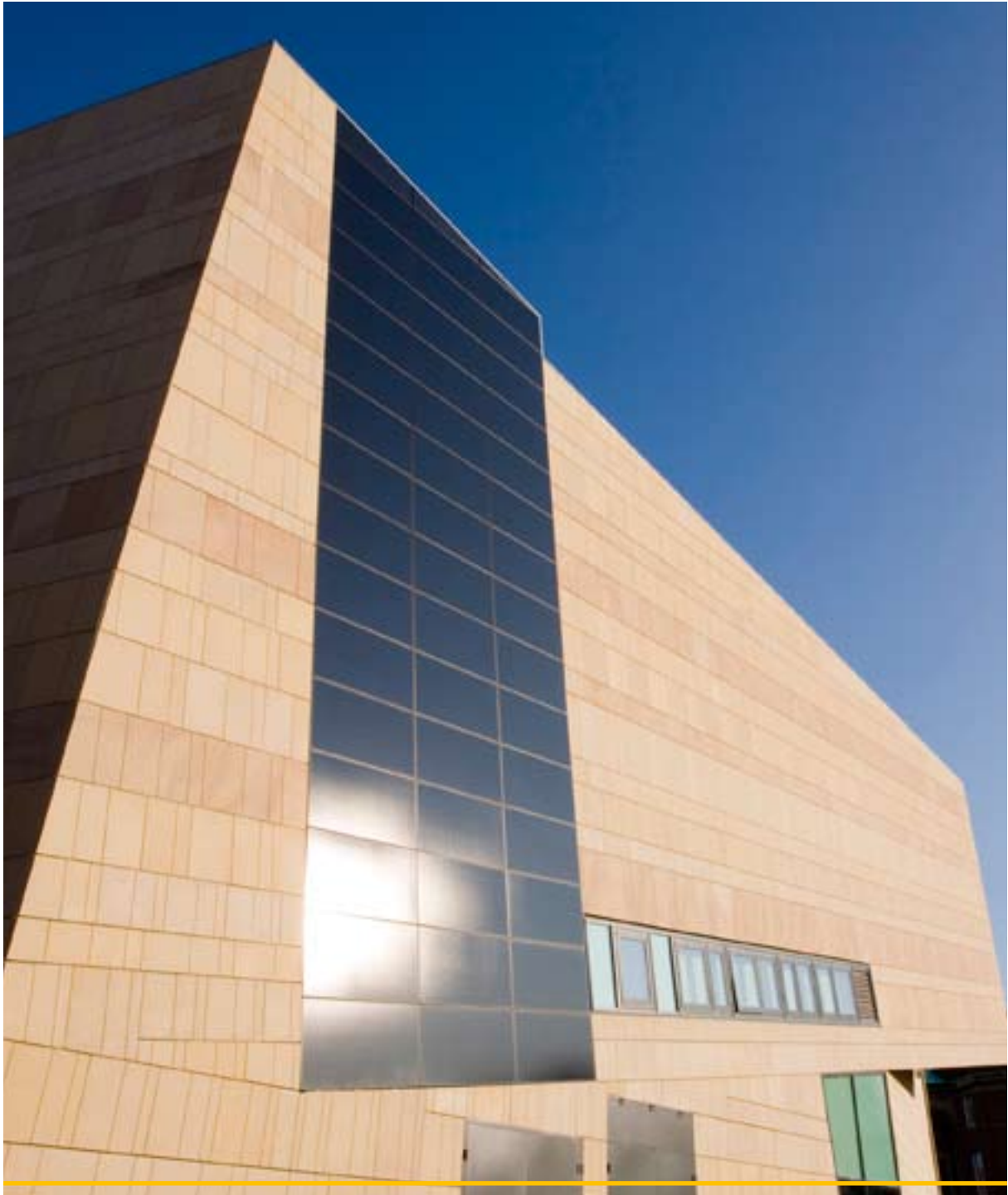
Graham Lucas Commons