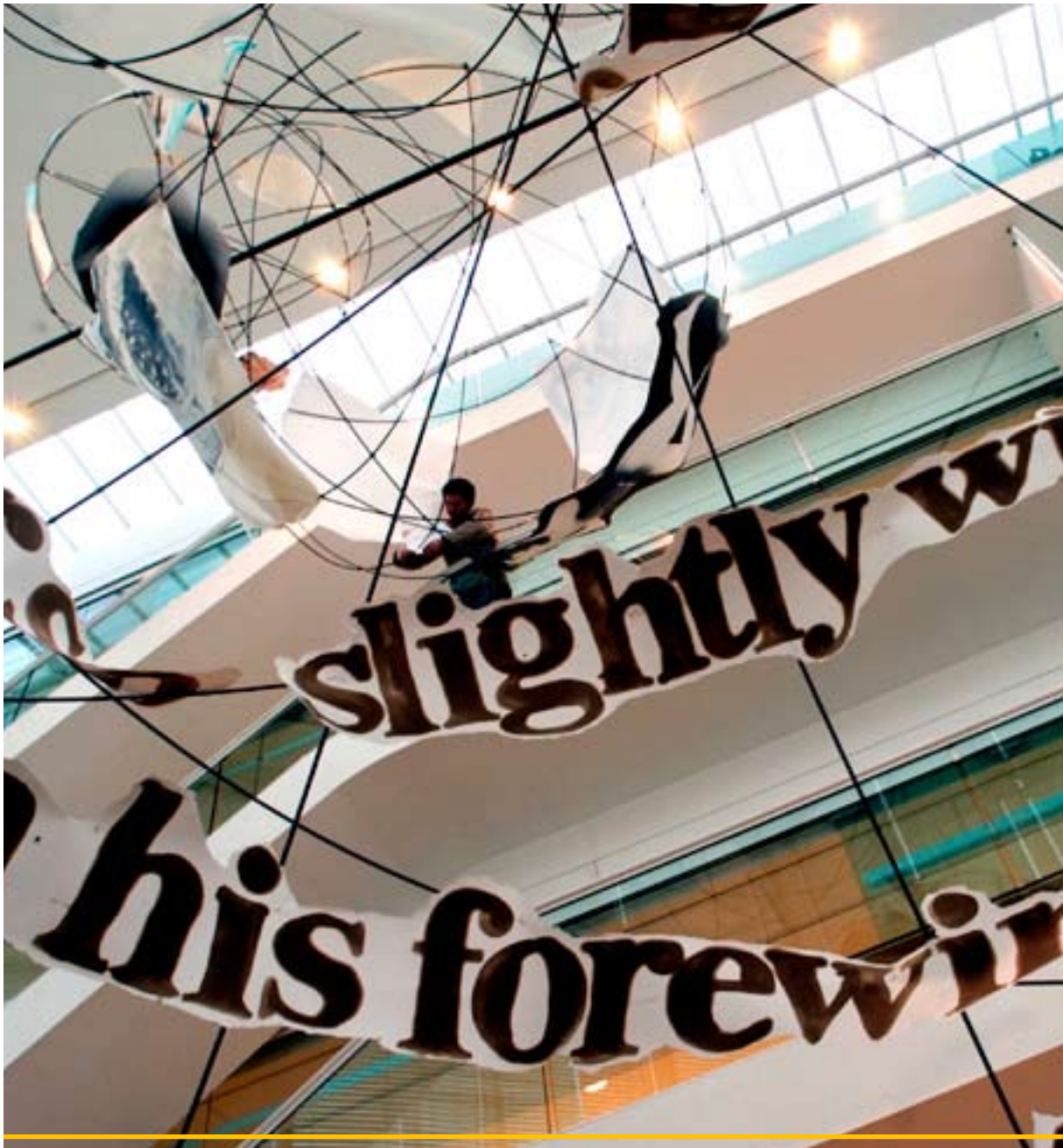
'Silent Pool', an exhibition at KUBE, Poole, with one of the artists, Aising Hedgecock at work on it's preparation.